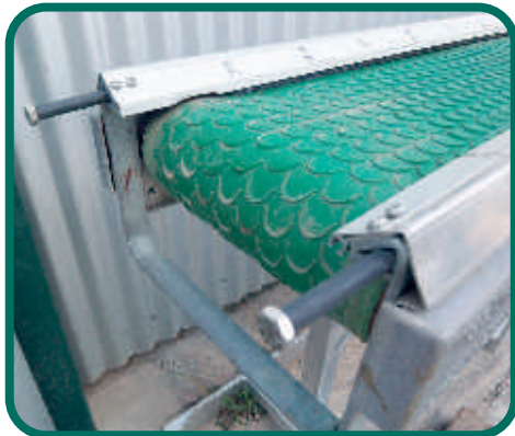
Conveyors have carry handles to enable easy transport of the lightweight conveyor

The conveyors run from a standard 240V outlet, so all you need is an extension lead, or even a generator to start moving your materials from one spot to the next.