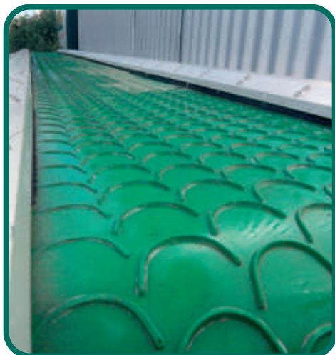
Our conveyors have cleated belts to assist fine material operations on steep slopes