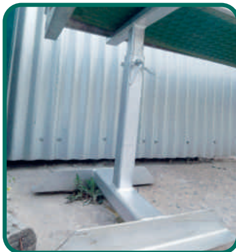
Height Adjustable Conveyor Stands available