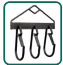
Special Scaffolding Hook