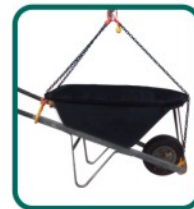
Wheel Barrow Chains