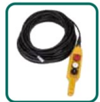
Optional control pendant with 15 or 30m of cable

The only wire rope hoist capable of 60m travel